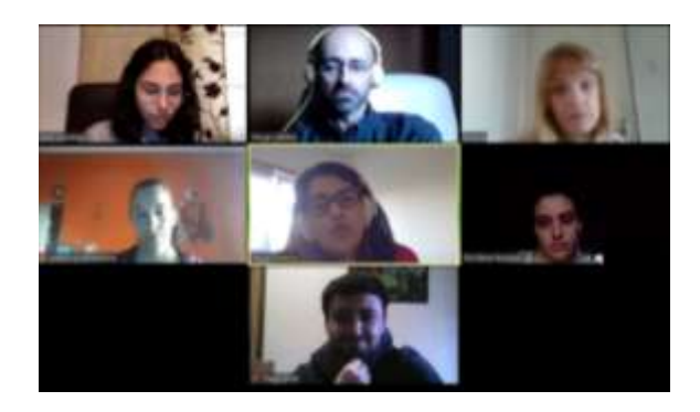
Zoom meeting of the Electrochemical processes group.

But the focus of CeFEMA's research in the field of electrochemical energy conversion and storage is not only based on batteries. Although Elon Musk likes to call them "fool cells", fuel cells are seeing tremendous advances in the last few years. It is natural that the CEO of Tesla sees them as threat to conventional LIB-based EVs. But fuel cell vehicles (FCVs) have undoubtedly several advantages over EVs, such as the fact that their fuel deposit can be quickly filled using the traditional supply system currently used for gas. CeFEMA researchers are studying lower-cost materials that can be applied in the fuel cell electrodes, thus allowing a significant decrease in the fuel cell cost and pushing forward the dissemination of FCVs.