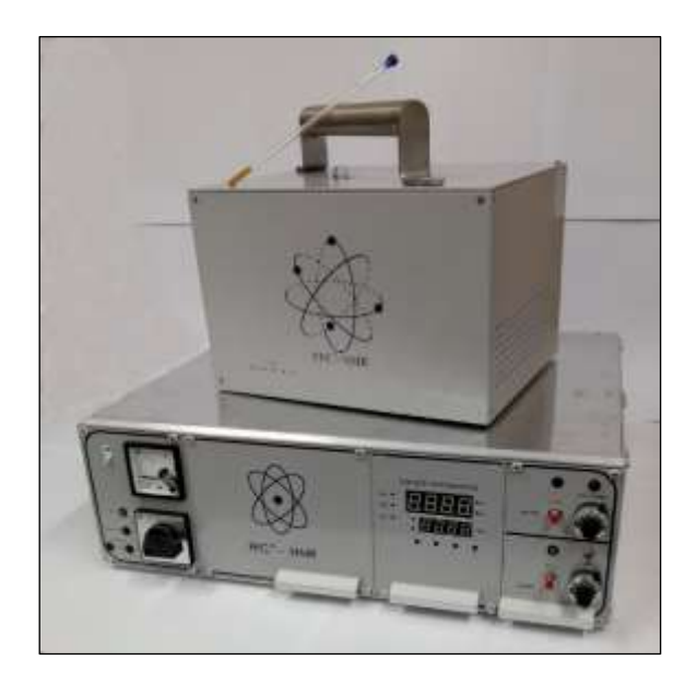
4<sup>th</sup> generation desktop NMR field cycling relaxometer developed at CeFEMA.

from 10kHz to 300MHz. While the upper end of this range (15MHz-300MHz) is spanned with constant field conventional relaxation measurements, the lower end (10kHz-9MHz) takes advantage of a home developed fast field cycling NMR relaxometer, unique in the world and patented in 2007 (PT 103705). An intense collaboration between the CFNMRS group and the IST Department of Electrical and Computer Engineering/INESC-ID allowed for this technological development and is about to deliver its 4th generation FFC NMR equipment at CeFEMA.